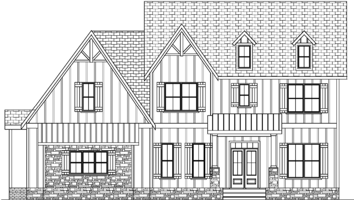
The Wellington - Farmhouse Elevation