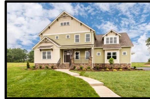
Alt. Lodge Elevation w/ in-law suite