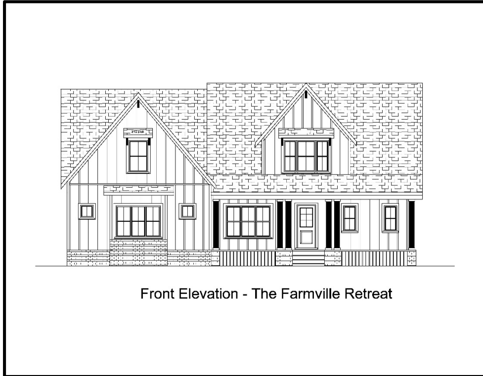
Front Elevation - The Farmville Retreat