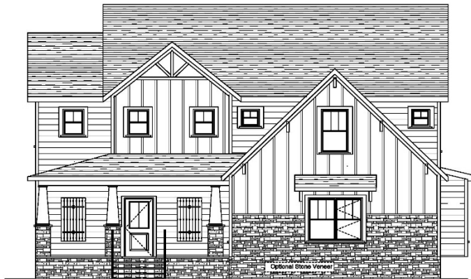
The Berkley - Opt. Coastal Elevation