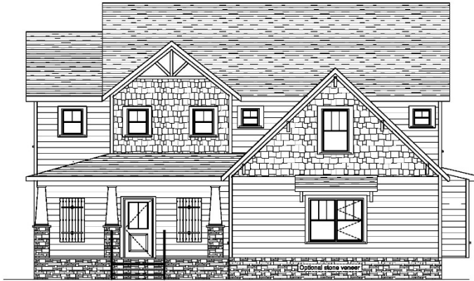
The Berkley - STD. Craftsman