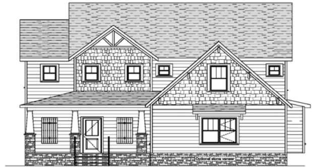
The Berkley - STD. Craftsman

On your lot pricing contact VA Jack Builders