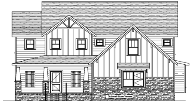
The Berkley - Opt. Coastal Elevation